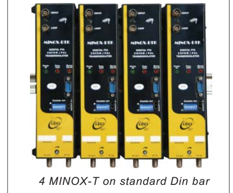
4 MINOX-T on standard Din bar